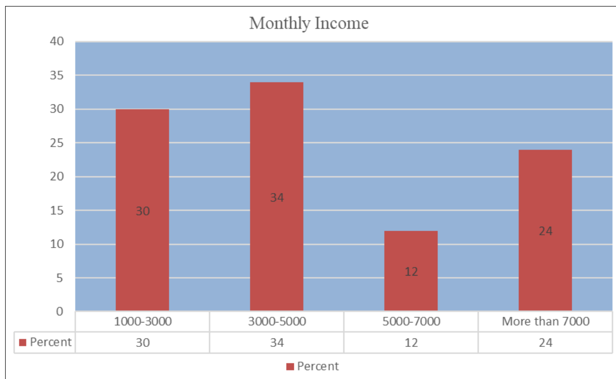
Fig 1: Socio-economic Status of the Respondents

From the above figure 1 analyze that there are 30% respondent’s income level is 1000-3000; 34% respondent income level is 3000-5000; 12% respondent’s income level is 5000-7000; 24% respondent income level is more than 7000. From this graph it is clear that maximum respondents are victimized whose income range is 3000-5000 taka. People choose govt. hospital health facilities due to low cost and closeness to home and specialist doctor also available here. The study finds out the economic status of the respondent and makes a relationship between the service of govt. hospital and economic condition. It indicates that, the lower income people went to the govt. hospital in Bangladesh and they being victimized for their economic condition. But low-income